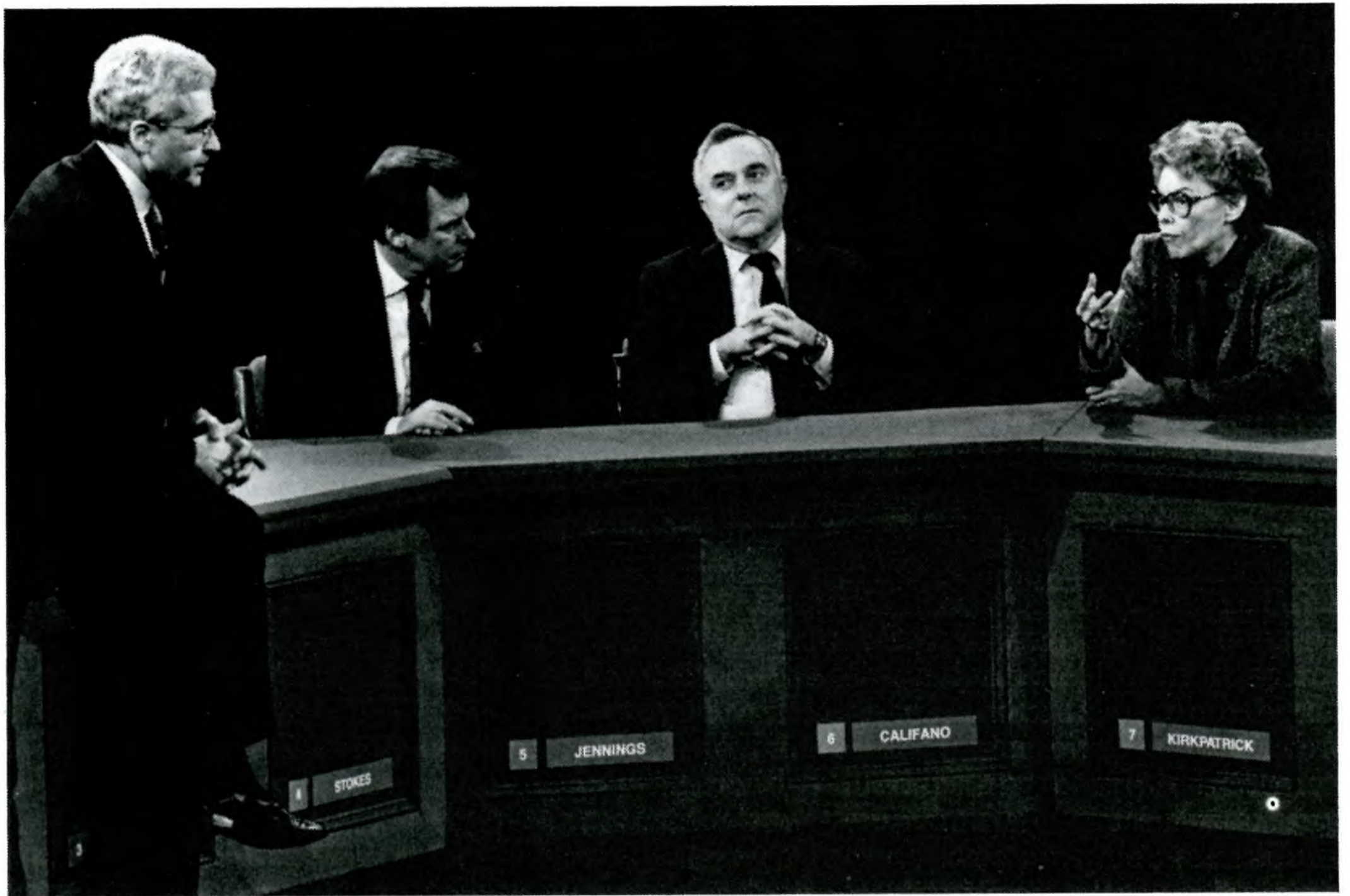
(Left to right) Arthur R. Miller, Peter Jennings, Joseph A. Califano Jr., Jeane J. Kirkpatrick.