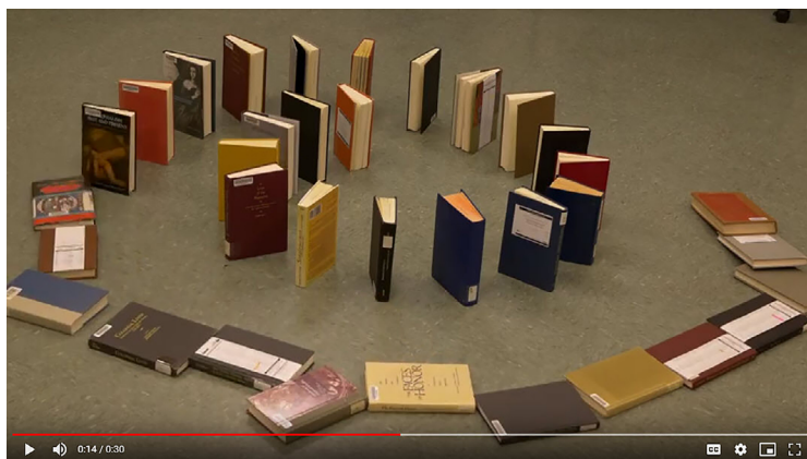
Figure 2. Sample visualization using a book dominos video.

With the third example, we went entirely digital and created an online timeline of sources from a chemistry dissertation, providing information about when and where each source