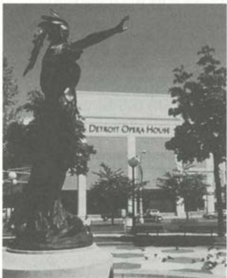
Newly renovated, the Detroit Opera House originally opened in 1922 as the Capital Theatre.

Examine the results of a research project