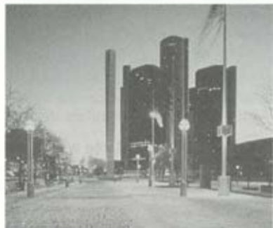
Hart Plaza—near the Cobo Convention Center

In just a couple years (on July 24, 2001, to be exact), Detroit will celebrate its tricentennial, but in just the past few years, Detroit's experienced an unprecedented rebuilding boom, and visitors to this proud city this spring will be uniquely positioned to witness firsthand some of these investments. Not only will you be able to learn from the conference programs and exhibits, but the host city will be a comfortable and fun place to look around and kick back for a few days.