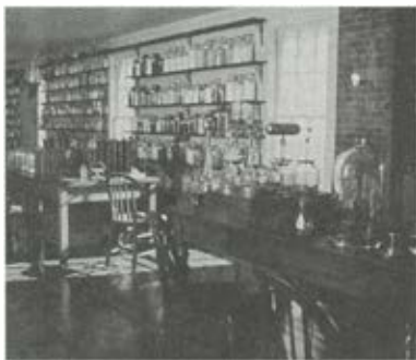
Edison's Menlo Park lab at the Henry Ford Museum and Greenfield Village.

On Saturday, April 10, you'll have another chance to go out for "dinner with colleagues" before heading off to the conference-sponsored reception at the Henry Ford Museum in neighboring Dearborn, Michigan. The museum's scope and scale are spectacular, and you'll be intrigued by, among other things, how they managed to get that enormous locomotive through the front door. Both receptions are included in the conference registration, as is the transportation to and from same. (Please note: next month's issue of C&RL News will feature an article devoted to Detroit restaurants.)