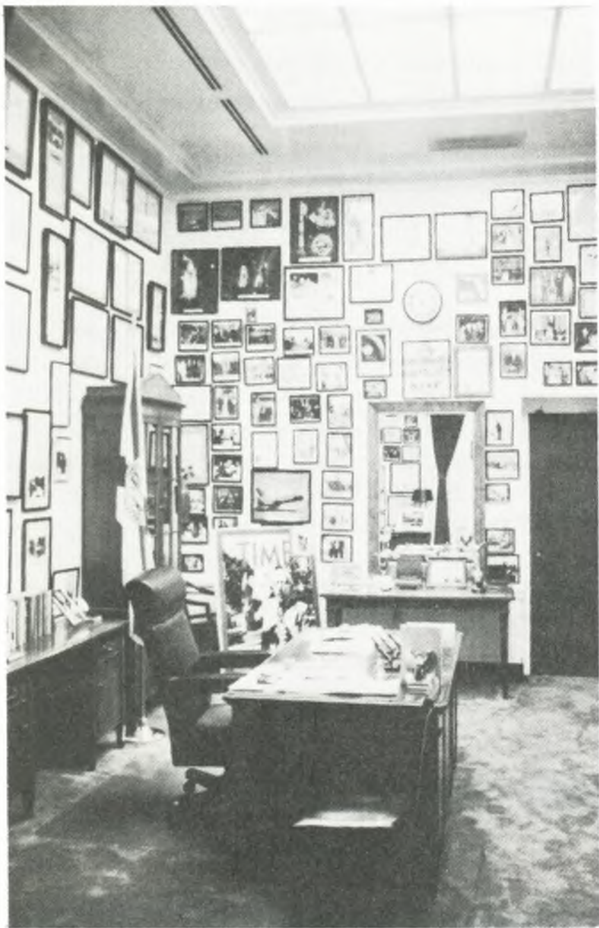
Replicated office of Rep. Claude Pepper, Florida State University.