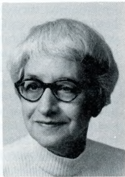
Henriette D. Avram