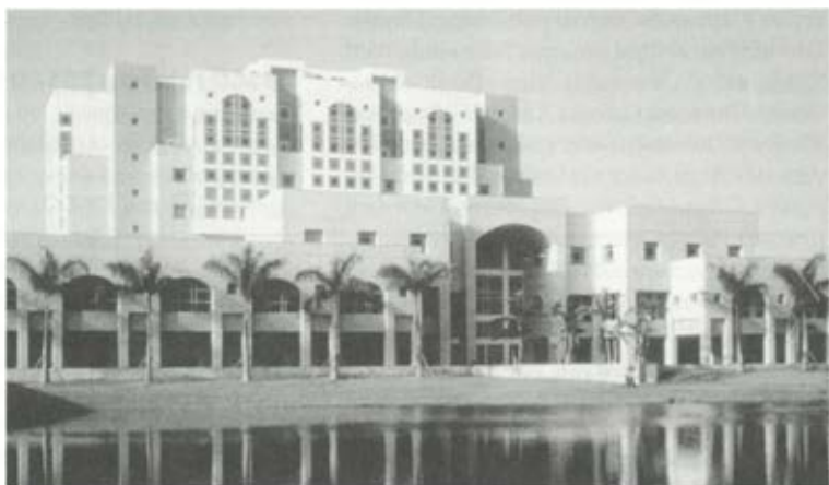
Florida International University's new Steven and Dorothea Green Library was completed at a cost of $40 million and offers more than 2,000 seats, a capacity for over 1 million volumes, and an ATM electronic infrastructure that delivers 25 MB of bandwidth to all workstations making possible transmission of full-motion video.

After three years of construction, the Steven and Dorothea Green Library at Florida International University Miami, Florida, has been dedicated and is in full use by the University community. Named for the current U.S. Ambassador to Singapore and his wife, the $40 million, 227,957 net square foot building seats more than 2,000 library users, has a capacity of over 1 million volumes and an ATM electronic infrastructure that delivers 25 MB of bandwidth to all workstations, making possible transmission of full-motion video. Among other electronic features are a 3,000 square-foot Geographic Information System (GIS) Center. The building includes 127 research carrels, 12 study