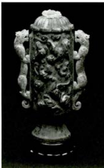
This vessel, believed to have been used by Chinese royalty in ancient ceremonies, was one of the rare artifacts donated to California State University-Northridge.