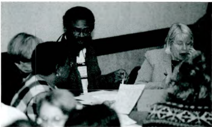
Workshops—a new program feature—gave attendees the opportunity to interact with each other and the speakers.

Special attention is focused on the joint serials archive, with each member "assuming responsibility for maintaining and providing access to selected journal backfiles so