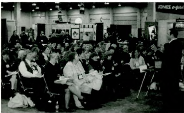
ACRL's new "Product Update Theater," where exhibitors could provide in-depth coverage of their services, proved popular with attendees and exhibitors alike.