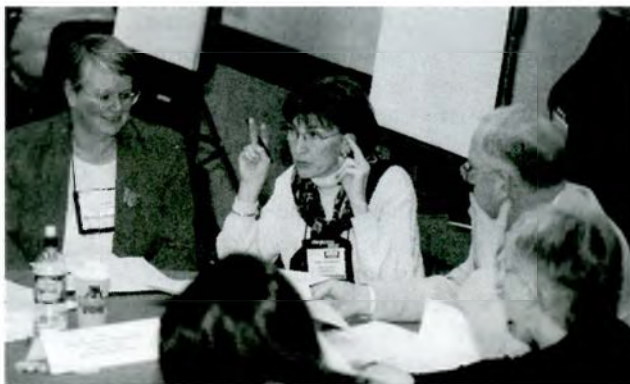
Interactive learning was an important element of ACRL's program sessions.

Examples include standardized tests, surveys, and statistics. They are important and necessary but are also limited in what they can assess. Indeed, they do not assess the activities in which libraries are increasingly involved. Pomo tools complement traditional assessment by measuring trends, examining processes, emphasizing holism, and allowing for dynamic conditions. Focus groups, interviews, observation, and portfolios allow individual, open-ended responses to be seen in the aggregate. These tools look at relation-