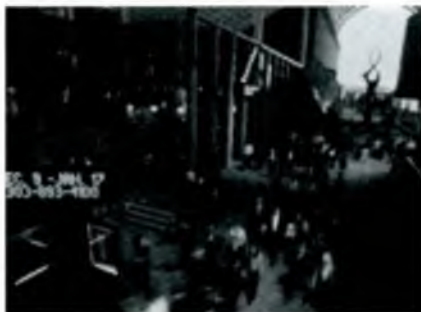
Denver Center for the Performing Arts