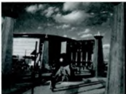
The Pepsi Center