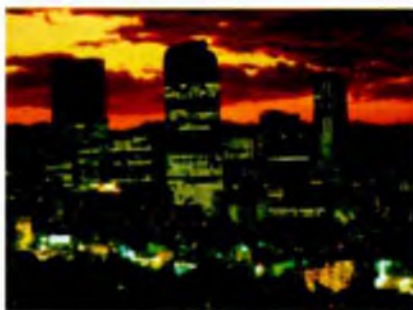
Denver at night