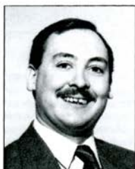
Forrest Link Northeast