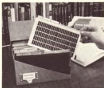
Over 1,100 LC Entries are contained on a single Microfiche card . . . millions compressed into a desk-top 20-inch Microfiche file.

The new way is the Micrographic Catalog Retrieval System that automates your search and print-out procedures. Basically we have done the filing and look-ups for you, giving you a quick-find index by both LC Card Number and Main Entry. You have only to select the proper Microfiche card from the quick-find index. Insert this card in a Reader-Printer. Just six seconds later you have a full-size LC copy.