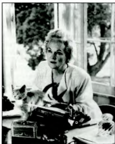
From "Katherine Anne Porter at One Hundred: New Perspectives," McKeldin Library, University of Maryland