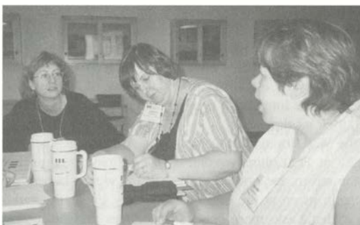
Participants share ideas during Immersion '99 .