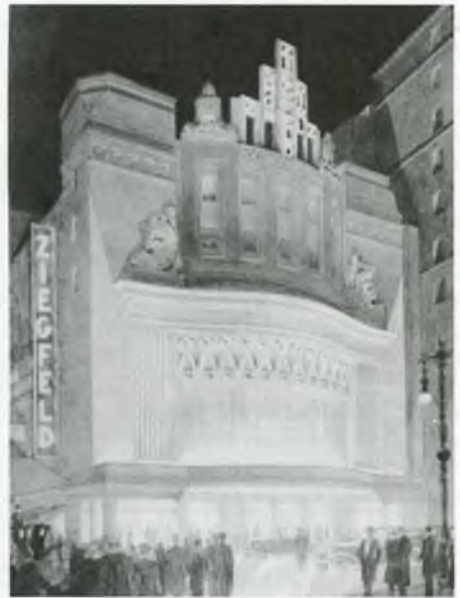
Hugh Ferriss's rendering of the Ziegfeld Theater in New York designed by Joseph Urban. From the Joseph Urban Collection at Columbia University.