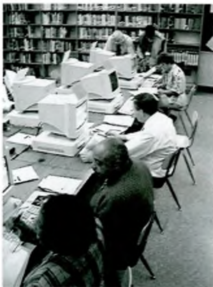
Northwestern High School science teachers actively engaged in research

After the first on-site workshop, teachers from Ferndale requested two additional half-day planning sessions during the year. Because two schools had withdrawn from the project, not only was this possible within the budget, but the initial one-year project was extended to two years. During that time, teachers from Ferndale developed a team research project for ninth-grade English stu-