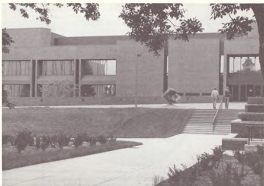
The Folke Bernadotte Memorial Library, Gustavus Adolphus College, St. Peter, Minnesota, 1982 John Cotton Dana Public Relations Award winner.

The John Cotton Dana Public Relations Award also involves a number of special awards each year. The judging committee selects 16–24 awards in this category for each contest. The majority of academic libraries receiving awards in the past decade have done so in this category. Special awards give recognition to single public relations projects which meet with great success in achieving a planned goal. In this category the Gustavus Adolphus College Library (also a 1982 award winner) won a special award for its fund-raising efforts in 1978 aimed at increasing library acquisitions. In 1979 the University of Oklahoma Health Sciences Center Library also received a special award for its technically sophisticated videotape orientation project that made use of special visual effects.