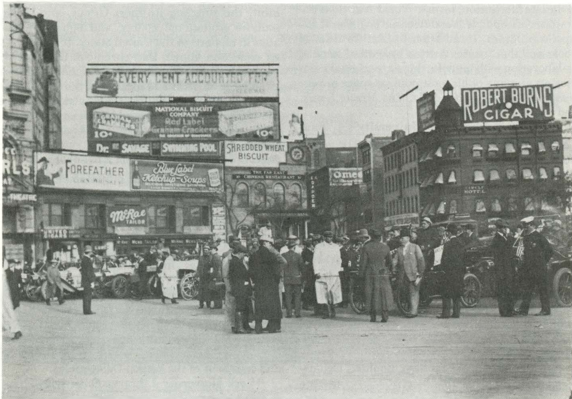
Early motoring photograph from the Detroit Public Library's National Automotive History Collection.

• Harvard University Library has received a Title II-C grant of $227,092 to support preservation microfilming of approximately 900,000 pages of fragile or rare materials. This is the eighth Strengthening Research Libraries Resources Program grant awarded to Harvard for this project. Materials scheduled for filming in the coming 15