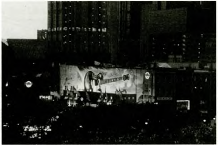
Nashville's Hard Rock Cafe is one of many nightspots that will tempt ACRL conference-goers in April.

For those with time, wheels, and/or a sense of adventure, there are some restaurants located further away from downtown that are worth