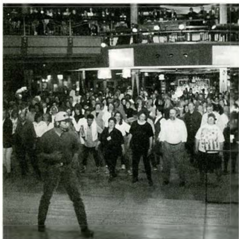
Conference attendees are treated to a night of country line dancing at the Wild Horse Saloon.

topic. In using the tutorial, students experience the circularity and multidimensionality of various research phases.