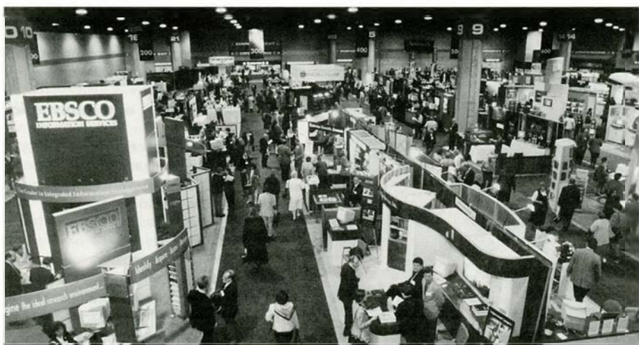
The exhibits hall at the conference was home to 756 exhibitors from more than 150 companies showing their state-of-the-art products and services.

As Skidmore College was recently ranked one of the top 25 most "wired" campuses in the country, this study of Skidmore students entitled "Undergraduate Students and the Digital