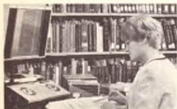
Everything for LC searching and full-size card copies at a single desk.

New Retrospective Collection — This new offering to M-C-R subscribers now makes it possible to extend your Microfiche file to include all LC and National Union Catalog entries back to 1953 — ten years earlier than previously available. Especially valuable for new libraries, or those expanding their services.