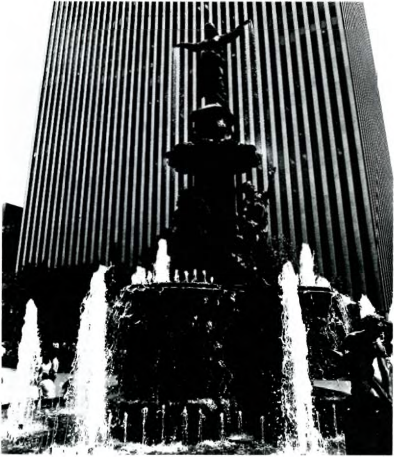
Historic Fountain Square blends the old and the new in downtown Cincinnati.

vided by Premier Events, 11695 Chesterdale Road, Cincinnati, OH 45246. You may use the form provided in your registration packet to reserve space for these tours. The mail deadline is March 27, 1989.