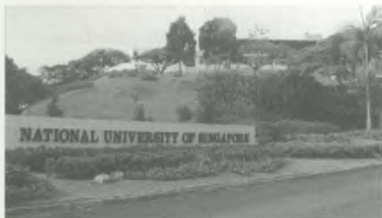
The National University of Singapore Library is implementing 3M's digital identification technology.

The 3M digital system tracks library materials by a "smart label tag" affixed to each item. Each tag includes a tiny antennae and micro-processor chip that contains information unique to the item it marks. The tags will be decoded via radio frequency waves so that items can be tracked as they enter, move about, and exit the library with patrons. The digital system will automate tracking lost items and taking inventory and minimize unauthorized removal of library materials as it provides for patron checkout that integrates magnetic security with detection systems located at the exits/entrances to the libraries.