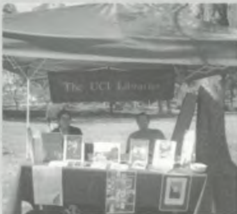
With a bright new banner to attract attention to their exhibit, library staff are ready to greet the next visitor.

In fact, a simple low-tech solution, a new bright blue and gold banner (UCI's colors) enhanced our visibility and drew visitors to our booth. This year, in addition to highlighting library publications and information about collections, services, and exhibits, library staff created a scav-