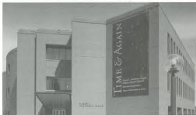
The University of Minnesota's new Andersen Library is a 185,000 square foot facility that features two storage caverns, mined from sandstone in the bluffs of the Mississippi River.

The Andersen Libraries houses the majority of the university libraries archives and special collections, the Central office of the MINITEX Library Information Network, and the Minnesota Library Access Center (which stores important but in-