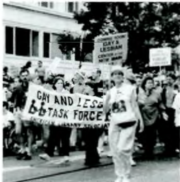
Members of the ALA Gay and Lesbian Task Force march at the Gay Pride Parade in San Francisco.