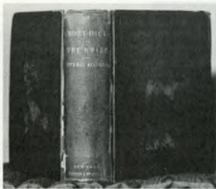
A rare copy of a first American printing of Melville's Moby Dick presented to the University of Wisconsin-Madison.

tion Management System (IAMS) plan for health sciences. The plan, developed in the last five years, calls for linkages of key clinical, educational, and research databases and systems; a state-of-the-art high-speed network connecting all areas of the HSC; and creation of a number of sophisticated tools in support of easy desktop access for users.