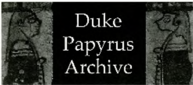
The Duke Papyrus Archive is part of the Digital Scriptorium Web site.

• Archaeological Institute of America. Primary American organiza-