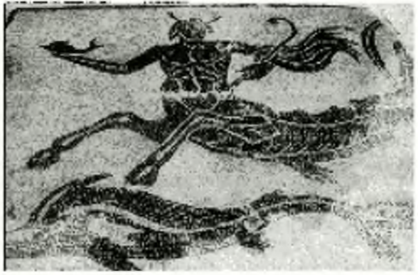
Mosaic in Roman Bath at Isthmia. Can be accessed through the Classics and Mediterranean Archaeology site and others.

• Classical Association of Canada. Major organization for classical studies in Canada. Access: http://www.trentu.ca/faculty/cac/ .