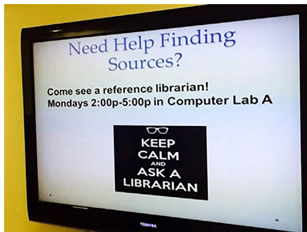
Signage at Stratton Foster Center.

Librarians believed the website tour/lecture