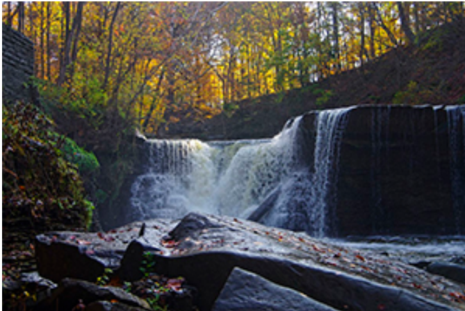
Cuyahoga Valley National Park.

• Cuyahoga Valley National Park ( https://www.nps.gov/cuva ), Ohio's only national park, is situated between Cleveland and Akron, but feels like it's a world away. Following the winding path of the Cuyahoga River, there is no shortage of wildlife en-