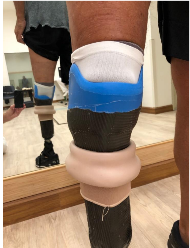
Figure 4: Image of the patient wearing the Söderberg 2.0 prosthesis.

used in P&O clinics and we believe that this technical note demonstrates a new option in manufacturing of prosthetic sockets that can further improve quality of life for the user. The positive subjective results provided by the patient, encourages us to further evaluate the technique and hopefully, with future clinical studies, the Söderberg 2.0 socket design will add to available options for the transtibial prosthesis user.