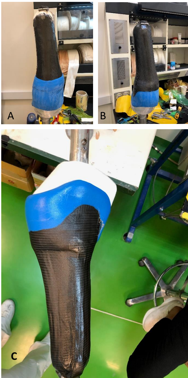
Figure 3: Images illustrating the (a) proximal brim over the first layer of prepreg carbon fiber, (b) trimmed version with second layer of prepreg carbon fiber applied and (c) final socket after curing.

The previous Söderberg socket design does not provide the user with the superior proximal socket comfort and sleeve protection offered in the current socket style. The patient noting increased lifespan of the liner was most likely due to the flexible brim reducing strain on the sleeve, whereas a regular hard socket brim might not have been able to do so. Although, outside of the purview of this technical note, a more robust set of research outcome measurements and comparison between traditional sockets could provide further insight. Due to a small sample size, care should be taken not to generalize current findings. In addition, this user's residual limb length was longer than average which might have affected his feedback of the device. In Figure 4, we provide an image of the patient fit with the Söderberg 2.0 prosthesis.