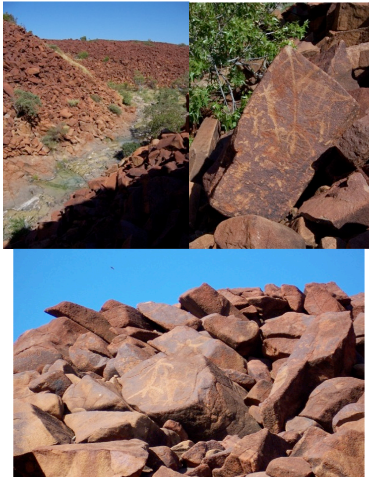
Figure 3: 'Rockpiles' with petroglyphs on the Burrup Peninsula.

In more recent history, the Pilbara has been constructed as a 'new place'. The Pilbara has represented wealth – actually and symbolically – since the 1940s, due to the growth of the wool industry. In the 1950s prosperity was derived from gold, tin, and columbite. Iron ore was discovered by Lang Hancock in the 1960s. Goldsworthy Mining was the first company and mining town (Goldsworthy) set up in the Pilbara. The name is indicative of the Pilbara's new identity. Successively solar salt fields were set up and offshore natural gas was found in 1971 which led to the establishment of the North West Shelf Project in the 1980s, owned by Woodside Energy Ltd, which exports LNG and LPG and is Australia's biggest energy resource development (Figure 4). Most recently (in 2010), an algae plant has been set up near Karratha to produce clean biofuel. Circa 90% of Australia's iron ore, 85% of Australia's LNG and 80% of Australia's crude oil and condensate are produced in the Pilbara. 12 The Dampier port is the busiest in Australia, distributing millions of tons of iron ore around the world.