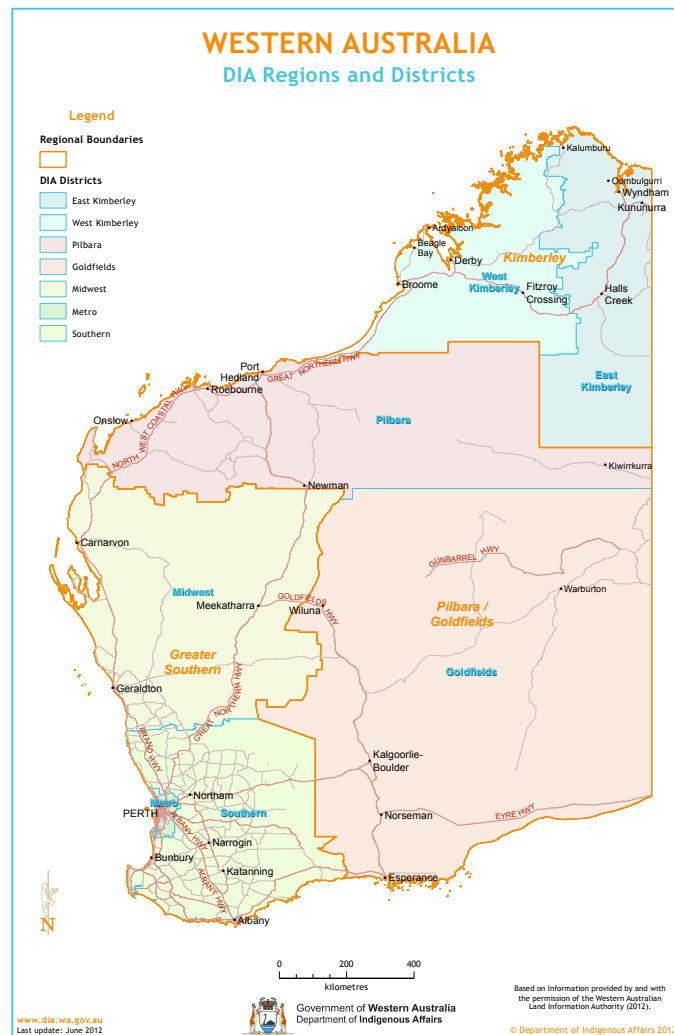
Figure 1: Department of Indigenous Affairs regions in Western Australia (Department of Indigenous Affairs, 2012; www.dia.wa.gov.au )

Geographically, three distinct formations prevail: the vast coastal plain, inland ranges and an arid desert region extending inland towards the Northern Territory border. A number of gorges and the highest mountains of Western Australia, Mount Bruce ( Bunurrinna , 1235m) and Mount Meharry ( Wirbiwirbi , 1251 m) are located in the Pilbara. The most distinctive topographical features are gabbro and granophyre boulder piles of an orange to deep purple colour, spinifex grasslands ( Triodia ), snappy gums ( Eucalyptus leucophloia ) and river red gums ( Eucalyptus camaldulensis ). There is a diversity of aquatic and terrestrial habitats which in turn produce a diversity of flora and fauna. There are 1,730 described plant species, of which 150 so far have been identified as endemic to the Pilbara (estimated number of endemic species 250). 11