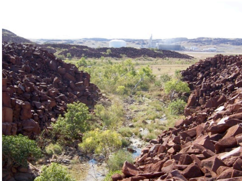
Figure 5: Location of spring and rock art in relation to Woodside plant.

Rothwell and Mulvaney both stress the meaning of the site in relation to the surrounding environment. A lack of understanding of such an interconnectedness of individual sites in the landscape poses a threat – and potentially completely destroys – a unique space.