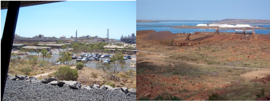
Figure 4: Woodside North West Shelf Gas Venture on the Burrup Peninsula (left) and stockpiles of iron ore and salt on the Burrup Peninsula and on an offshore island (right) (photographs by Britta Kuhlenbeck).

There are slogans assigned to the Pilbara, such as ‘sun, sea and salt’ 13 or ‘supplying the world, growing the Pilbara’. 14 They draw on its physical geography and highlight resources, actual and potential, as a key feature of the Pilbara. Current media headlines stress the role of the Pilbara as a ‘powerhouse’ that prevents Australia from sliding into a recession. The functional role of the Pilbara as a ‘new place’ is further stressed by references to the region as the ‘engine room’ of Australia, which ‘drives’ the country economically. The German term Inwertsetzung which is frequently used in geosciences in the context of capitalizing on nature’s resources implies a sense of value derived from human gain and illustrates a ‘new place’ association even further. In an article entitled ‘Culture Clash’, the northern correspondent of The Australian , Nicolas Rothwell, states: ‘What was once an austere wilderness rich in ceremonial sites is now an industrial zone, dissected and divided, reshaped and tamed’. 15