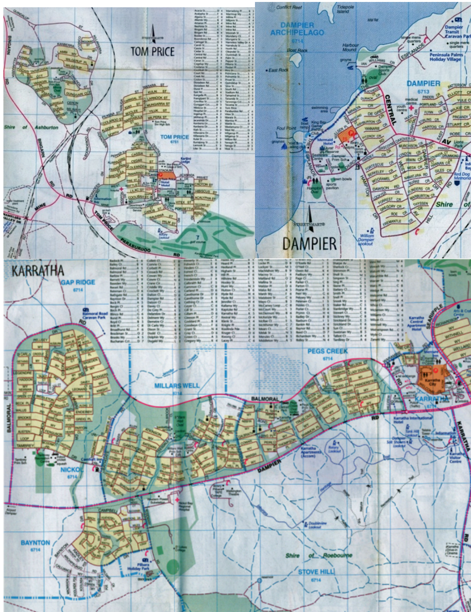
Figure 8: Town maps of Tom Price, Dampier and Karratha (StreetSmart Touring maps, Pilbara, Western Australia, Third Edition, 2005; reproduced by permission of the Western Australian Land Information Authority, CL06-2013).

The uniform design of towns in the Pilbara foregrounds functionality – which in turn constitutes a town’s (lack of) identity – such as Newman, Karratha, or South Hedland, where the shopping centre is the hub of the town. The urban grid structure forms a contrast to the ‘old space’ organic pattern of Indigenous Dreaming pathways criss-