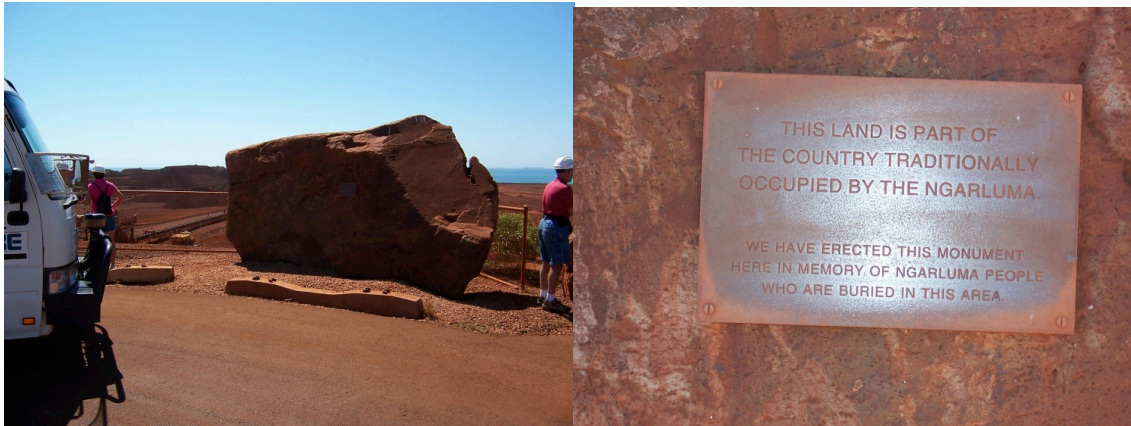
Figure 11: Memorial on Robe River premises recognising Ngarluma land ownership, Cape Lambert.