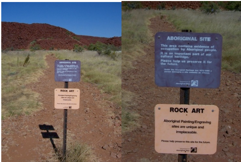
Figure 6: Signage indicating rock art on the Burrup Peninsula.

'The Burrup debate' demonstrates the ways in which a lack of understanding and consequently appreciation affects preservation of Indigenous cultural practices and places of significance. The Burrup Peninsula, an 'ancient place of worship', is 'overwritten' by new 'places of worship', such as mine sites and industrial plants. A filmic example is