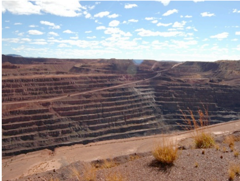
Figure 7: Photo of iron ore mine site.

The urban designs of towns in the Pilbara are a further example of the ways in which ‘old space’ is overwritten as a ‘new place’.