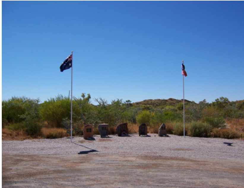
Figure 10: Sculpture at Woodside gas plant 26.