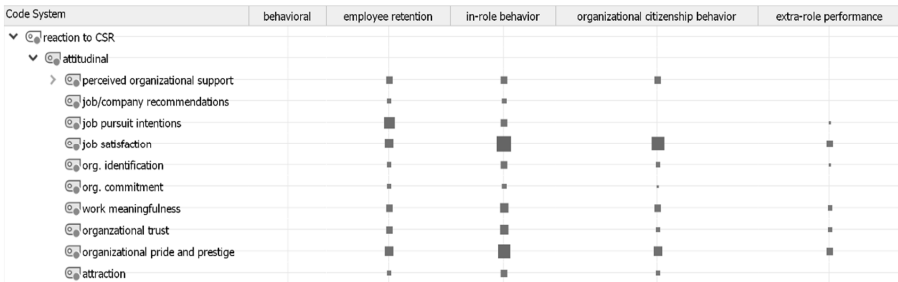
Figure 11. Co-occurrence of the attitudinal and behavioral reactions to CSR codes

The most common behavioral reaction to the company’s CSR identified was in-role behavior, which occurred the most with the most common code identified when exploring the level of ESR identity of the employees – job-related CSR tasks (figure 10). Employee retention, being also a significant outcome, can be proven by the highest level of co-occurrence with the code job pursuit intentions, as seen in figure 11. The intention of the employees to stay in the company hidden behind the code employee retention also shows high co-occurrence with the organizational pride and prestige and job satisfaction, which supports the findings presented in the theoretical part. Organizational citizenship behavior also seems to enhance job satisfaction. Even if the participation in the CSR activities of the employer is connected to their role in the company, it seems to stimulate the feeling of work meaningfulness, organizational trust, pride, and job satisfaction amongst the respondents (see figure 11).