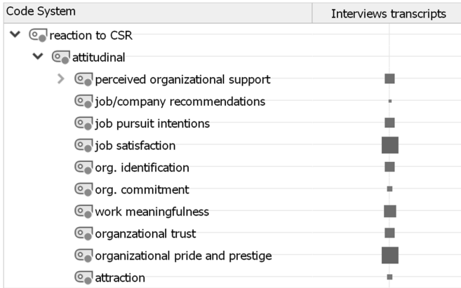
Figure 12. Frequency of the attitudinal reactions to CSR codes across documents