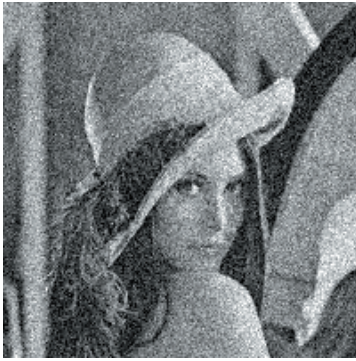
a) Noisy Image.