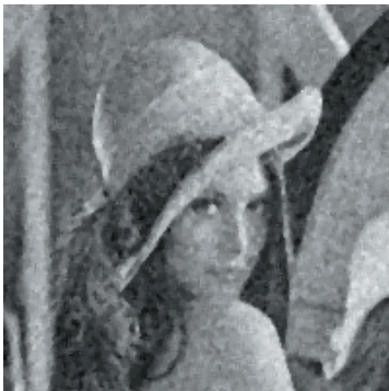
d) Filtered Image using Median.