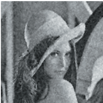
c) Filtered image using Wiener.