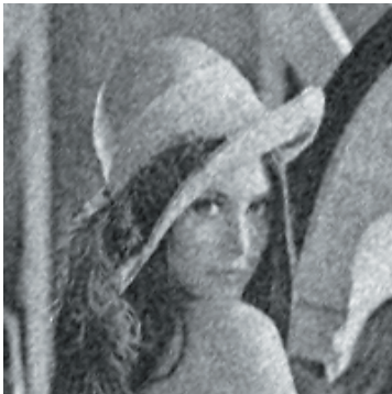
b) Filtered image using the network.