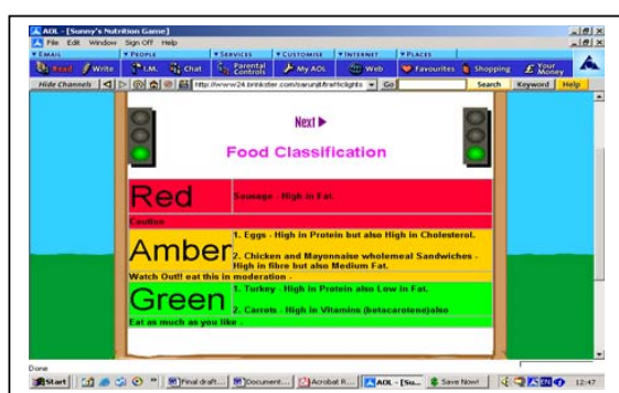
Fig. 6. Foods classified using a traffic light system.

Once the character has been fed the three meals the child is able to view the overall results. If the character has been fed a good diet, the character appears at normal size, thanking and congratulating the child for feeding it a good diet. If the character is fed a poor diet, then a screen similar to the one shown in Figure 3, where the character has increased in size, is displayed. In both cases the child is displayed with a screen representing a traffic light system, as shown in Figure 6.