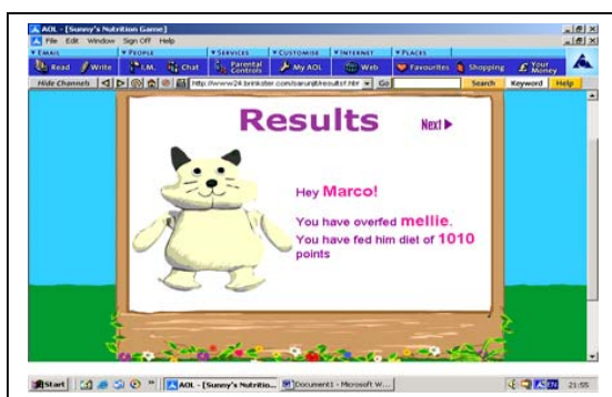
Fig. 3. An example of an overfed character.

Following from the concept of Artie Beat in Nutrition Mission, the system was developed using the idea behind the Tamagotchi, an interactive pet in a key chain designed by the Japanese to help their children to learn about looking after a pet. The intent for the nutrition program was that children would take responsibility of a character they have chosen, by feeding and exercising it. The effects of this would be demonstrated by the character's size. For instance, if the character was fed a poor diet, then it would increase in size as shown in Figure 3. If the character was fed a healthy diet and well exercised, then it would remain the same. The reason for choosing character size was mainly due to the age of the target group being so young i.e. 4-5 year olds. It was thought that the change in the characters' size would be the simplest way of demonstrating the impact of the food that was eaten.