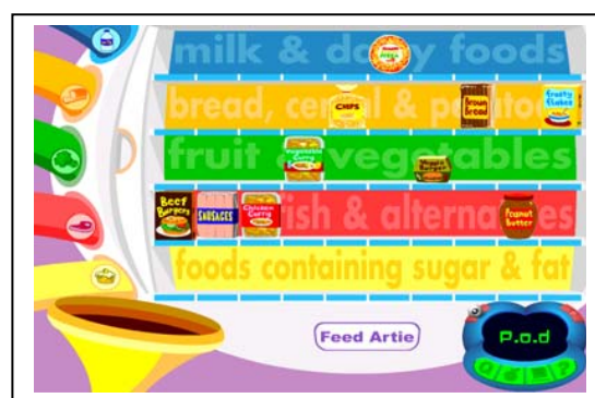
Fig. 2. Shelves in Nutrition Mission.

This program is better than the previous one in that it enables a child to gain some idea of the effect that certain foods have on a person. However, categorisation of the foods using the shelving system was considered to be rather misleading in places. For instance, some foods that the program categorised as meat, such as chicken curry, obviously contains meat, however this particular dish is also high in fat. Although children are able to see a description of each item if they wish, a description of fat content is not provided. Consequently children could be misled to believe that the item is a meat product, which is fine to eat, but they would not learn that it is also high in fat. As previously mentioned, fat is a major contributory factor in a child becoming obese and therefore this moves away from what is trying to be achieved. Another example is the case of the fruit flavoured drink that was classified under the 'fruit and vegetable' category. In some cases these types of drink do contain fruit extracts, but they are minimal and these drinks are predominantly made up of sugar. Consequently, a child may misinterpret this to mean that fruit flavoured drinks are healthy.