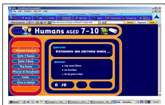
Fig. 1. A question from food hygiene program.

On their website, the Foods Standards Agency has developed an 'interactive tools' area which has various links to calculators, games, quizzes and education. Under the games section is a program aimed at 7-10 year olds whereby children can learn about food hygiene. This is achieved by presenting the child with a quiz containing various questions about food hygiene. Figure 1 shows an example of a question screen. The child progresses through the quiz, attempting to answer correctly as many questions as possible. The concept of this program is good and encourages the children to learn facts about food hygiene. However, it may mean the children simply memorise the answers without actually being able to understand the material and, more importantly, without being able to apply it to themselves.