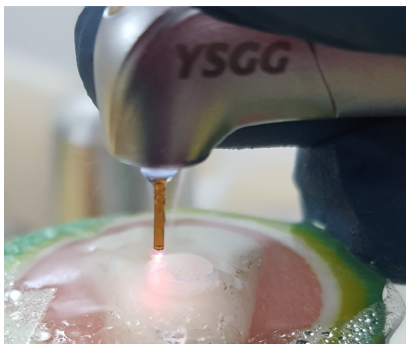
Figure 2. Laser irradiation of the ceramic disc cemented to the bovine tooth

The specimens were placed on a surveyor, and the laser handpiece was fixed on a modified arm so that the laser tip is positioned perpendicular at a distance of 2 mm to the ceramic disc 7 and scanning movements were performed which are horizontal movements perpendicular to the disc surface 9 (Figure 2). Each disc was irradiated from incisal to cervical area and vice versa in 10 s. which is considered as one cycle. Since the period of irradiation was 60 s., this means that each disc was irradiated for 6 cycles.