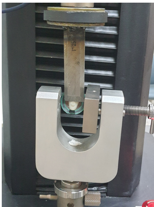
Figure 3. Universal machine loaded with specimen, the blade is parallel to the adhesive interface

Shear bond strength values were recorded in Newton (N) and converted into megapascals (MPa) as follow: MPa = N/area , Area = \pi r^2 ( \pi = 3.14 , r = 2.5 ), MPa = N/ 19.63 .