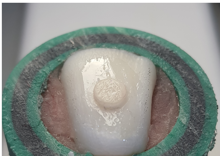
Figure 1. Completed cemented sample.

The ceramic discs were cemented to the prepared enamel surface of the bovine teeth according to the manufacturers' specifications. IPS Ceramic Etching Gel® (4.9% hydrofluoric acid) (Ivoclar, Vivadent®, Schaan, Liechtenstein) was applied to the internal surfaces of the discs (intaglio surface) for 20s. Then, disc specimens were rinsed and dried thoroughly with water spray and air respectively, then silane Monobond Plus® (Ivoclar, Vivadent®, Schaan, Liechtenstein) was applied to the internal surfaces of the discs for 60 s. and allowed to air dry 16,17 . Variolink Esthetic® LC (shade light+) (Ivoclar, Vivadent®, Schaan, Liechtenstein) resin-based cement was then applied to the internal surface of the disc which was seated into place on the prepared flat tooth surface under load by using a glass slide applied on the ceramic disc over which a load of 75 mg was applied for 1 minute. An initial cure of 1 s. from each side of the disc with the LED curing light was applied to remove excess cement. The final cure of the cement was accomplished afterwards with a 20 s. light-cure with the curing light in contact with the glass slide and figure (1) shows the completed cemented disc. Finally, the samples were stored in distilled water and stored at 37°C for 24 h. prior to the debonding procedure 16 .