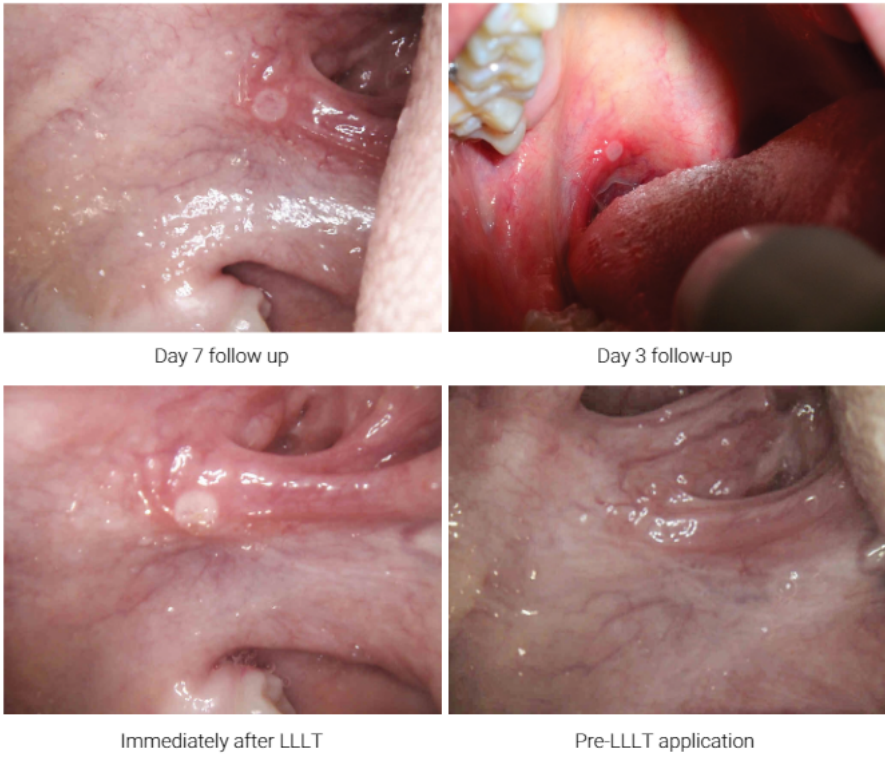
Figure 2. Treatment with LLLT