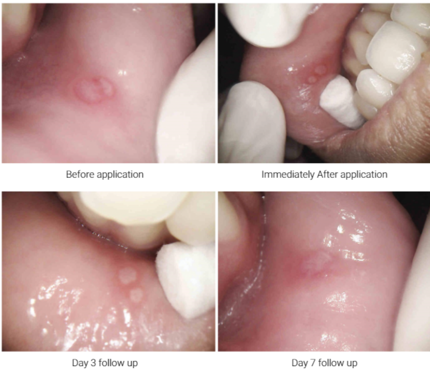
Figure 3. Treatment by Triamcinolone Acetonide 0.1%