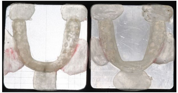
Fig. 1. Superior view of the splints with a flat inferior surface adapted with acrylic resin on the superior surface of the seven and thirteen degrees planes.

A malocclusion splint was obtained by an anteroposterior discrepancy simulation of about 4 mm of mandibular prognathism. The normal (control group) and altered (study group) maxillary plane angulation data was transferred to mandibular models: two mandibular models were mounted