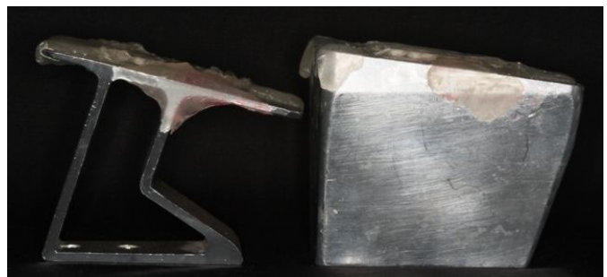
Fig. 2. Lateral view of the splints with a flat inferior surface adapted with acrylic resin on the superior surface of the seven and thirteen degrees planes.