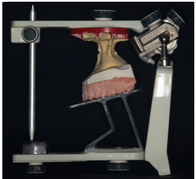
Fig. 3. Lateral view of the maxillary model of the control group mounted in a 13 degrees plane.

by the adapted malocclusion splint and according to each maxillary model angulation of 13 and 7 degrees.