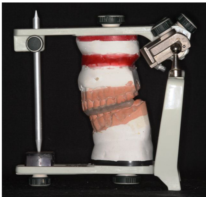
Fig. 5. Lateral view of the maxillary model advancement of 8 millimeters and mandible model with the intermediate splint made from acrylic resin.

All the samples of the control and study groups, totaling 40 maxillary models, were remounted according to intermediate splint from maxillary advancement of 4 mm. It is important to highlight that it was used the mandible of 13-degree mandibular plane angle to set the control group and the mandible of 7-degree mandibular plane angle to set the study group. The same measurements performed in vertical and anteroposterior plane for standardization was applied and registered as post-operative values. Forty maxillary models for advancement group of 8 mm were remounted, and measurements were registered in the same manner.