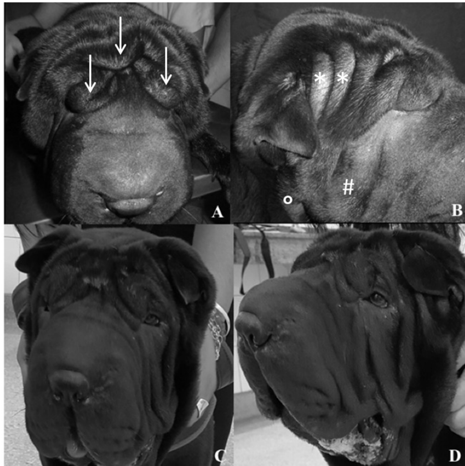
Figure 1. Photographs of male Shar-pei, cranial view (A) and right lateral (B) of the head, revealing facial folds in supraorbital regions (arrows), zygomatic (*), masseteric (#) and side of the neck (°), obstructing visual axis. In (C) cranial view, in (D) left side view, 12 months after rhytidectomy in archs and use of modified walking suture.

The evaluation of the hematimetric indexes and biochemical profile performed in the preoperative period were within the normal range for the species.