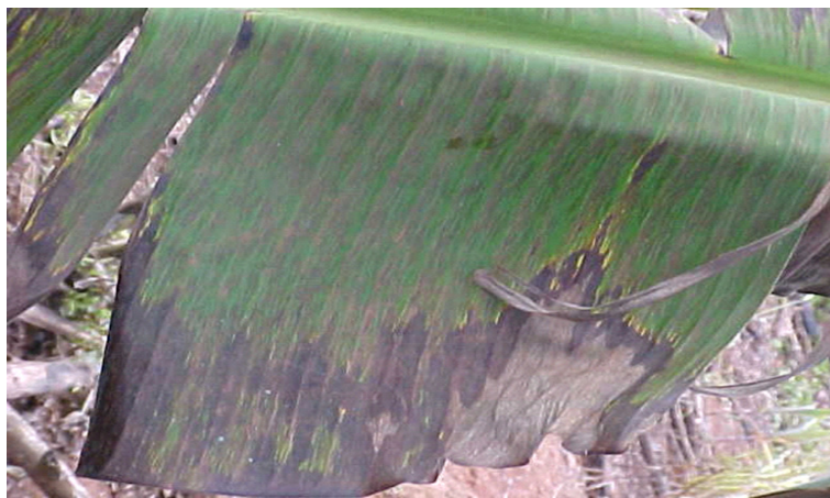
Figure 2. Banana leaf infected by Mycosphaerella fijiensis .

conclude that actually infected seedlings distributed in the M. fijiensis free area were responsible for the introduction of this fungus into Canabrava do Norte, Confresa, Porto Alegre do Norte, and São José do Xingu, assuming that: (i) these counties composed a M. fijiensis free area recognized by the Ministry of Agriculture, Livestock, and Food Supply in 2008; (ii) these counties were surveyed each three months, but they became contaminated by M. fijiensis in 2013, simultaneously; and (iii) Silva (2013) recorded that in Confresa county black leaf streak dispersal occurred from the outbreak to properties until the radius of 30 km and the major concentration of dispersal was verified at the radius of 10 km from the outbreak (Figure 3).