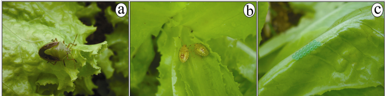
Figure 2. Edessa meditabunda over lettuce. (a) Adult on cv Elba (curly group), (b) nymphs on leaves of cv Elba (curly group), and (c) posture in cv Teresa (american group).

plants had up to 24 adults of stinkbugs. Of the 127 nymphs observed, 89.76% were in cv Elba and 10.24% in cv Teresa . No nymphs were found in smooth and clippings cultivars. Fifty postures were collected, of which 56%, 28%, 10% and 6% were in Elba , Teresa , Mimosa and Regina cultivars respectively (Figure 2).