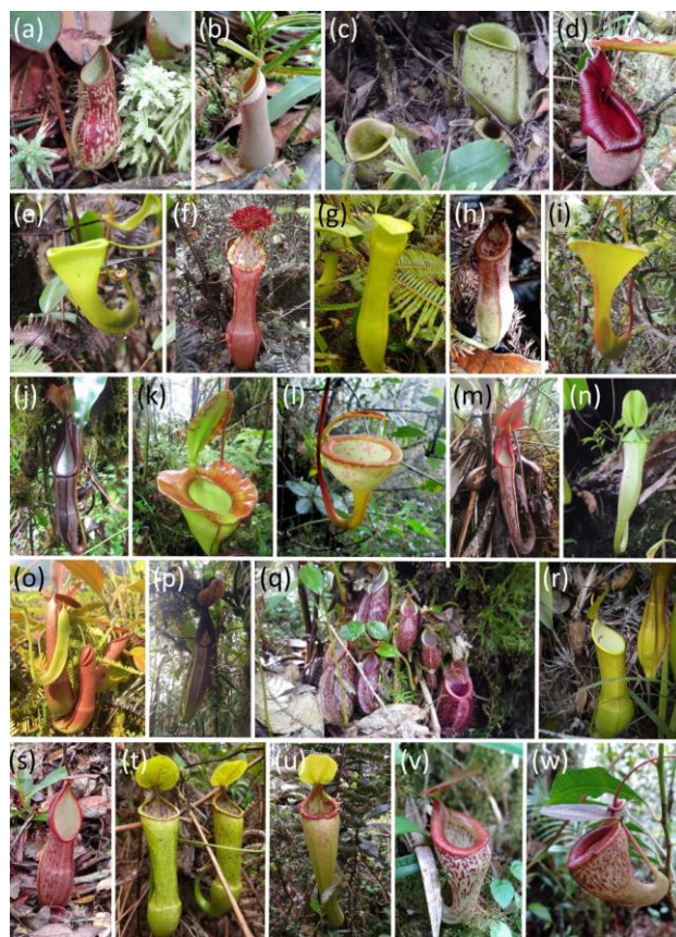
Figure 3 Nepenthes species recorded from West Sumatra: (a) N. adnata (lower pitcher), (b) N. albomarginata (lower pitcher), (c) N. ampullaria (rosette pitcher), (d) N. bongso (lower pitcher), (e) N. dubia (upper pitcher), (f) N. eastachya (lower pitcher), (g) N. gracilis (upper pitcher), (h) N. barauensis (lower pitcher), (i) N. inermis (upper pitcher), (j) N. izumiae (upper pitcher), (k) N. jacquelineae (upper pitcher), (l) N. jamban (upper pitcher), (m) N. lingulata (upper pitcher), (n) N. longifolia (upper pitcher), (o) N. mirabilis (upper pitcher), (p) N. naga (upper pitcher), (q) N. pectinata (rosette pitcher), (r) N. reinwardtiana (upper pitcher), (s) N. rhombicaulis (upper pitcher), (t) N. singalana (upper pitcher), (u) N. spatulata (upper pitcher), (v) N. talangensis (upper pitcher), (w) N. tenuis (upper pitcher). Authorities are noted in Table 1

the entire global population of some of these locally endemic species. Conservation needs and responsibilities are therefore extremely high. Further exploration and formal records would add to the quality of existing assessments. Beyond assessing their conservation status, the key threats to the majority of Nepenthes in Indonesia are land-use change and collection for the horticultural trade (Clarke et al. 2018; Cross et al. 2020), so practical conservation methods need to address these challenges that will only be successful with the support of local communities and governments. These fascinating restricted range and threatened Nepenthes species in Sumatra need further study, especially regarding their distribution and population status. A more detailed exploration of the mountainous regions of Sumatra may well find further populations, as we have done here.