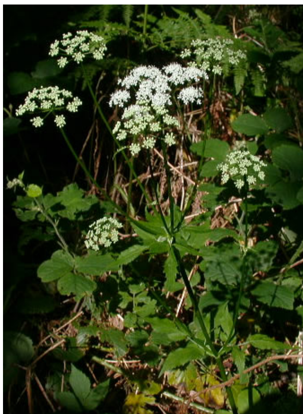
Fig. 2. Aegopodium podagraria L.