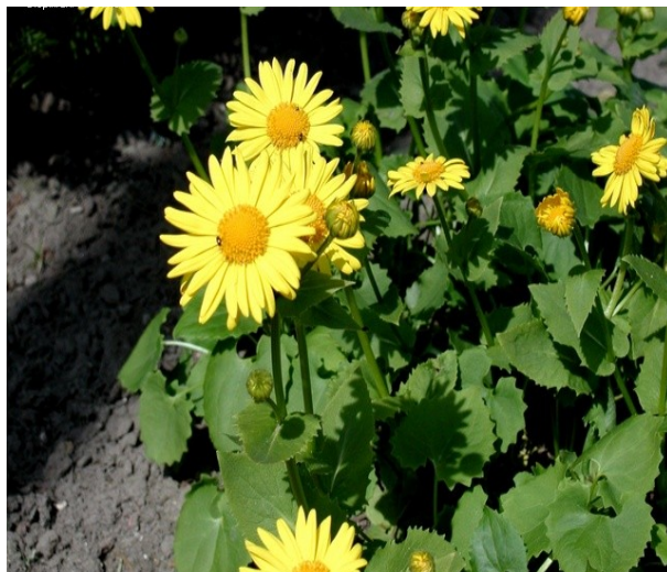
Fig. 1. Doronicum columnae Ten.

Biochemical function of organic acids is dependent on different ecological conditions. They are donors of protons in some oxido-reduction reactions, for example -conversion of malic to oxalic acid. Some earlier studies showed that content of organic acids in plants is dependent on respiration, transpiration, various biochemical processes in plants, plant's phenophase (Gašić, 1992).