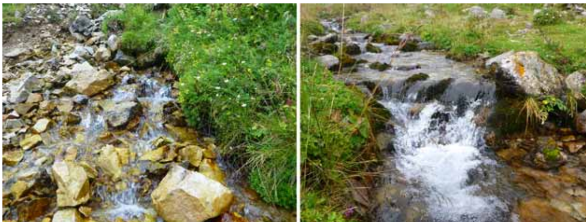
Fig. 2. Two types of habitats where Hydrurus foetidus was recorded: mountain spring (left) and mountain stream (right)

from small stones by scraping or by squeezing of mosses growing on rocks and stones. The collected material was fixed with a 4% formalin. Small portion of H. foetidus was collected and observed under the microscope from temporary slides under 40 x magnification. The identification of H. foetidus was supported by the following references: Starmach (1985), John et al. (2003) and Wehr et al. (2015).