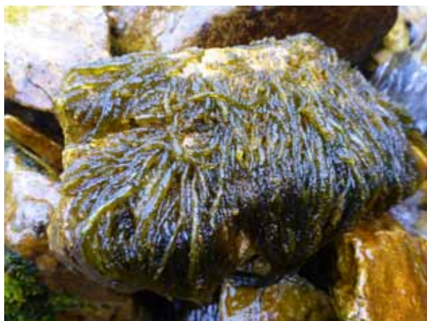
Fig. 3. Thallus of H. foetidus (Villars) Trevisan