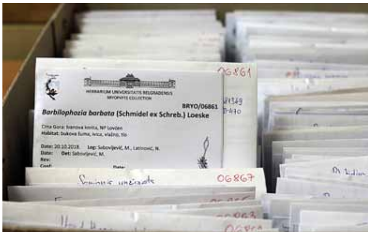
Fig. 1. Collection of bryophytes in the BEOU Herbarium. Shown are digitized specimens included in the Bryo database