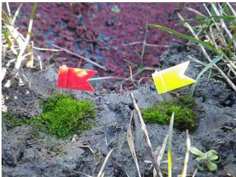
Fig. 2. Reintroduction of Henediella heimii (marked red) and Entostodon hungaricus (marked yellow), propagated axenically in vitro , acclimatized and finally released to nature on potentially suitable site in Banat, Serbia!

a significant number of new taxa has been reported for the country, but also some previous data has been revised, so Serbia currently numbers 830 bryophyte taxa (1 Anthocerotophyta, 142 Marchantiophyta, 687 Bryophyta).