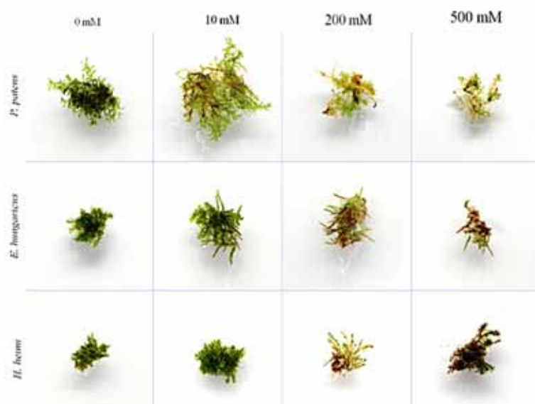
Fig. 3. The appearance of the investigated species cultivated for three weeks in culture in vitro on a nutrient medium with the addition of various salt concentrations

salt. During long-term stress, the ratio of proline to free amino acids also increases with the increase of salt concentration in the medium. In addition to the non-enzymatic components, as a response to the salt