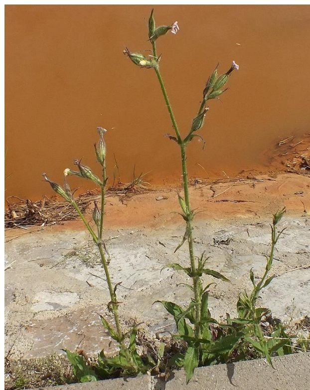
Fig. 2. Habitat of species Silene noctiflora L., on the locality Gračanika stream

detected and appropriately identified. The floristic structure in the Gračanika river locality can be seen from next phytocenological record: Typha latifolia L. 4.4., Polygonum lapathifolium L. +.1, Arenaria serpyllifolia L. 1.1., Mentha aquatica L. +, Polygonum aviculare L. +, Convolvulus arvensis L. +, Stellaria media L. (Vill). +. Floristic deficiency in this locality is due to the fact that the river banks (or riverbed) are paved by stony blocks so that only a few number of species have managed to inhabit them (Fig. 2).