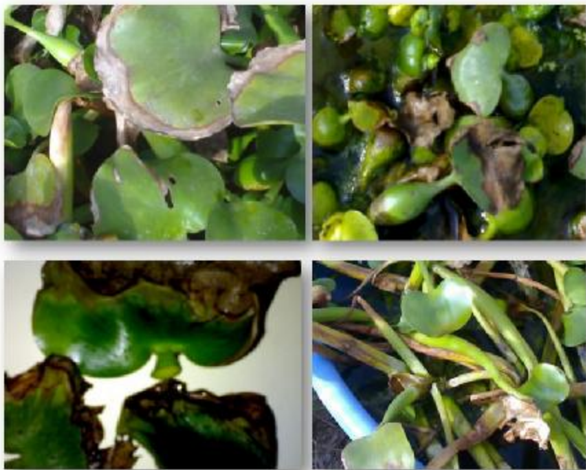
Fig.1: The spotting symptoms on the leaf blades and swollen base leaves.