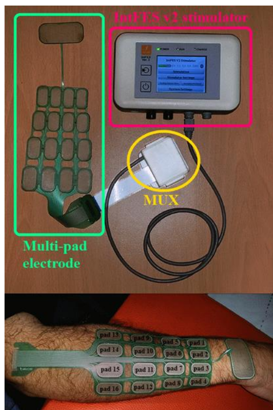
Fig 1. FESUpperExt system components (top) and the stimulation electrode on the forearm of one hemiplegic patient (bottom). The stimulation system consists of IntFES v2 stimulator (Tecnalia R&I, San Sebastián, Spain) and the multi-pad electrode with 16 cathode pads designed to cover the motor points responsible for wrist, fingers and thumb extension.

after every session to ensure the same position of the electrode in the following session. Virtual electrode definition on each following day started from the pattern map used in the previous session. If VEs for the 3 defined movements didn't provide adequate response they were modified by manually adding/removing fields and changing amplitudes. In this manner same pads were favored and changes in VE configuration were discouraged.