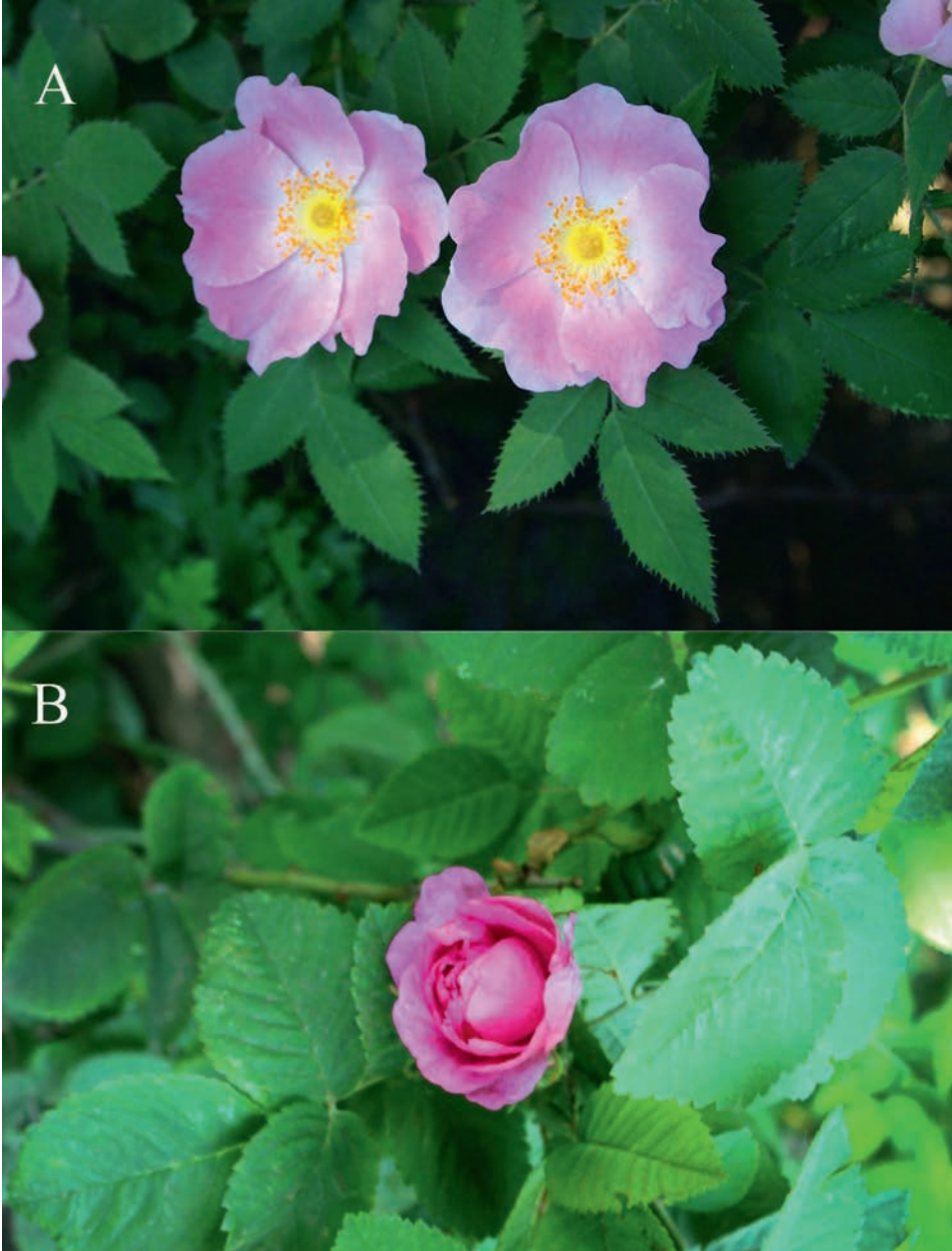
Fig. 3. Rosa jundzillii Besler var. jundzillii , specimen from Poland, Gorzów Wielkopolski city, Zwiadowców Street (A); Rosa × francofourтана Muenchh., specimen from Poland, Gorzów Wielkopolski city, Podgórna Street (B)