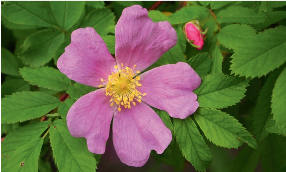
Fig. 2. Flower of Rosa blanda Ait.