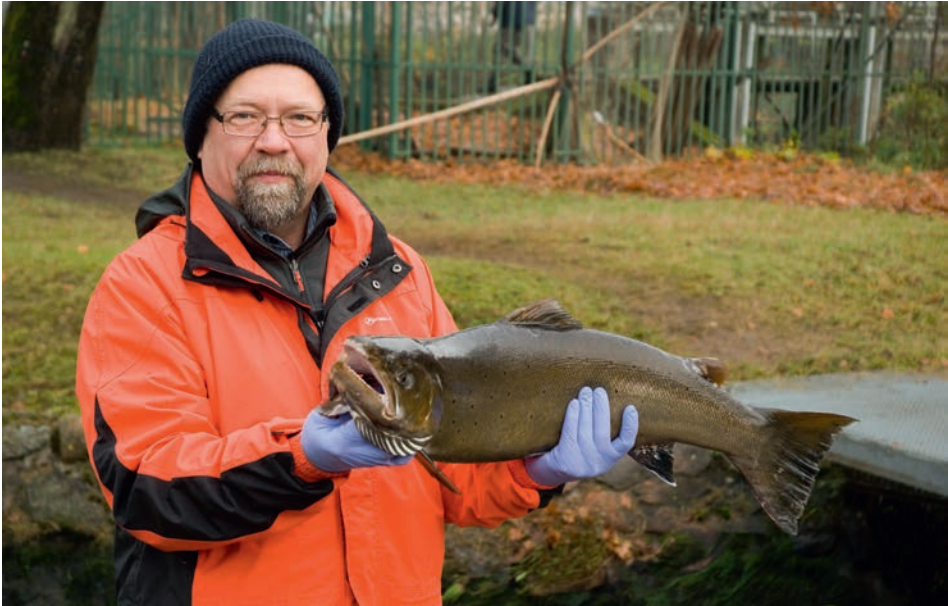
Fig. 1. Sea trout with author for scale

occurrence is linked to low water temperature during these months. Large fish concentrations during spawning season create perfect conditions for contagious diseases to spread (Munro, 1970). The first visible signs of UDN are small, grey lesions on the operculum, fins, and head (Bruno et al., 2013). These rapidly ulcerate and frequently become infected with opportunistic pathogens, mainly the oomycete Saprolegnia diclina Humphrey, which has expansive growth that makes skin damage even greater (Roberts, 1993). Such extensive epidermal damage induces osmotic haemodilution leading to circulatory failure and the death of infected fish (Bruno et al., 2013). The Słupia River is one of the first rivers where occurrence of sea trout spawners with UDN-like symptoms was reported (Bartel et al., 2009). Since then, the disease occurrence is observed on a yearly basis (“The Valley of Słupia”, management personal communication).