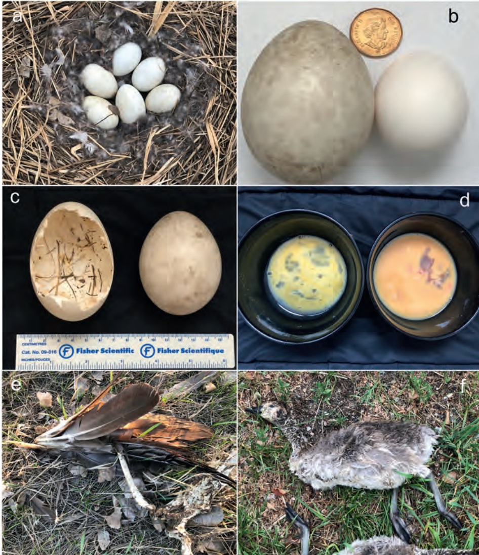
Fig. 2. Canada geese nest with eggs (a); size comparison between eggs of Canada geese (left) and poultry chicken (right) (b); a Canada goose egg shell found outside a nest (left) and an unhatched egg found in an abandoned nest (right) (c); comparison between egg yolks: chicken (left) and Canada geese (right) (d); predation by local mammals (like badgers, coyote and foxes) or birds (like raptors) act as a natural balance for regulating wild Canada geese populations (e); accidental road kills are a common cause of death of young, juvenile and adult Canada geese (f)